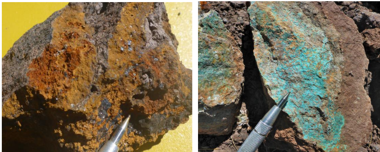
Figure 3: ABOVE LEFT Gossanous volcanic containing 3.75% Zn, 136g/t Ag and 3.13% Pb. ABOVE RIGHT Cu-encrusted volcanic containing 0.61% Cu. The samples were taken from outcrop aligned NE-SW at Colina Roja (Figure 2).