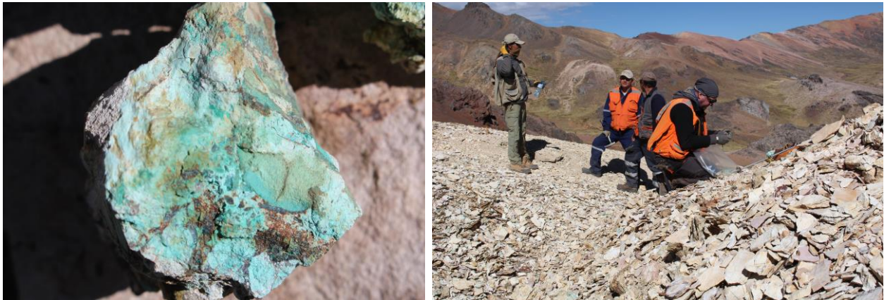
Figure 4: ABOVE LEFT Sample from a shallow mine working with visible copper discovered during a reconnaissance mapping and sampling program at Alteration Ridge. This material peaks at 4.94% Cu and 294g/t Ag. ABOVE RIGHT The exploration crew at the shallow working. The silicic nature of the dump material is evident in this picture.

A shallow mine working was identified in the recent reconnaissance mapping and sampling at the southern end of the new Alteration Ridge Prospect. Dump material with visible copper mineralisation was sampled in lieu of a lack of in situ mineralisation. The sampled material is a highly silicified “flinty” volcanic tuff with visible secondary copper mineralisation (malachite and chrysocolla). Assay results returned strong copper and silver, with peak copper: 4.94% Cu and peak silver (same sample) 294g/t Ag .