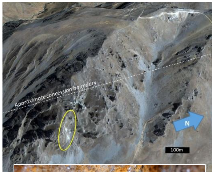
Figure 4: RIGHT Oblique satellite image showing the location of the Huari mine working. Like Vilcapuquio, mineralisation at Huari is associated with a NW-SE trending lineament/fault.

A brief mine work mapping and sampling program comprising the collection of 13 samples was completed in October 2016. The objective of this work was to better understand the nature of mineralisation. Preliminary data and early observations suggest that the nature and style of mineralisation is like that occurring at the Company's Riqueza Project, Zn-Ag-Pb vein-hosted replacement mineralisation.