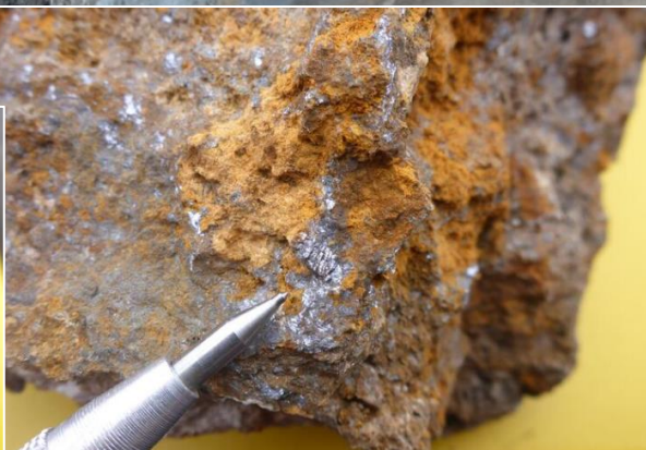
Figure 5: ABOVE/LEFT Highly weathered vein material from the Huari mine working. Galena (lead sulphide) is visible in the rock specimens that are otherwise highly gossanous. At the time of writing assays are pending.