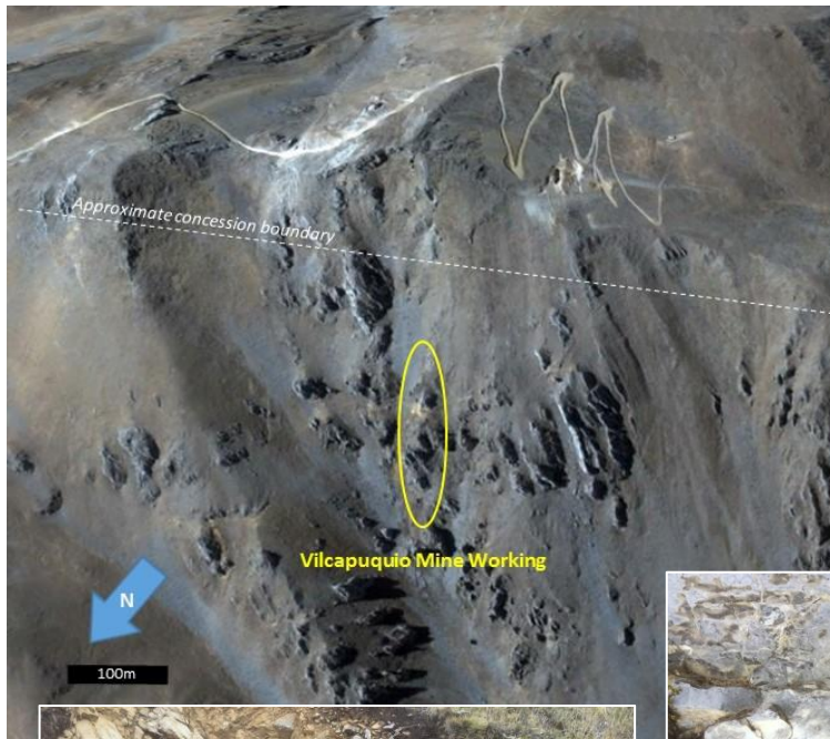
Figure 1: LEFT Oblique satellite image showing the location of the Vilcapuquio mine working. Mineralisation at Vilcapuquio is associated with a NW-SE trending lineament/fault.

Inca Minerals Limited ( Inca or the Company ) (ASX code: ICG) has recently completed its first mapping and sampling program ( CR-Program 1 ) at its Cerro Rayas Zn-Ag-Pb Project ( Cerro Rayas or the Project ). Cerro Rayas is the Company's second zinc-focused project, located 15km NE of Inca's Riqueza Project. The purpose of CR-Program 1 was to inspect two sets of old mine workings occurring within the Project area, Vilcapuquio, in the north of the Project area (Figure 1) and Huari, in the south of the Project area (Figure 4). The Vilcapuquio working is the larger of the two with two levels of artisanal mining following sphalerite (zinc sulphide) and galena (lead sulphide) mineralisation associated with calcite stockwork veining (Figures 2 & 3). The Huari working, the most recently operated artisanal site, was also inspected. It has a single adit accessing mineralisation.