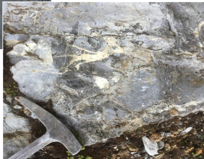
Figure 2: BELOW LEFT The main entrance to the mine workings. BELOW RIGHT Galena and sphalerite are associated with calcite stock effecting Jumasha Formation limestones.