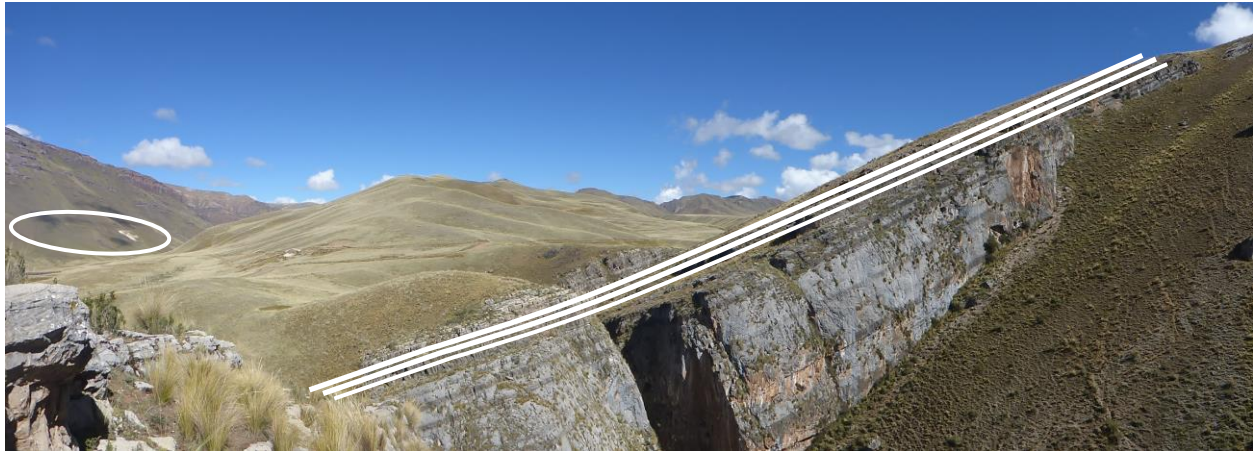
Figure 2: ABOVE The upper manto sequence (white lines) at Humaspunco are open ended to the south in the direction of Uchpanga, seen in the background (white circle), some 2.5kms away. With further reference to Figure 3, it is believed Humaspunco and Uchpanga are genetically and possibly spatially connected. Drilling will test this hypothesis.

A schematic section of the Pinargozu Zn-Ag-Pb+(Cu-Au) deposit in Turkey (Figure 3) shows how distal manto and vein Zn-Ag-Pb mineralisation is related to Ag-Pb-Zn+(Cu-Au) intrusive and skarn mineralisation and how fault dykes occur above the intrusive/skarn zone. An important aspect of this section is the scale. The lateral spread of mineralisation at Pinargozu Mine is over 6kms. It is therefore possible that Humaspunco and Uchpanga, only 2.5kms apart, are part of a large intrusive-replacement complex. In the context of the Figure 3 section, Uchpanga would be proximal to an intrusive body (above it) and Humaspunco would be lateral to an intrusive body.