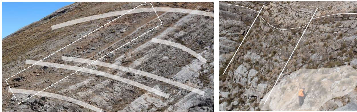
Figure 1: ABOVE Photo record of the three different forms of mineralisation that will be targeted in the Riqueza drilling campaign. LEFT Manto style mineralisation and vein-style mineralisation. In this photo, facing west across the Callancocha Structure at Humaspunco, an upper manto horizon is visible dipping into the hill (white box). Also visible are numbers of NS veins (opaque white lines) which are part of the Callancocha Structure, believed to be a feeder zone for the Humaspunco Zn-Ag-Pb deposit. RIGHT Breccia style mineralisation will also be targeted. Visible in this photo is the breccia being investigated in the foreground (white shading) and a collapse-structure in the background (white lines) showing the drop of the limestone layers above the breccia. Veins, mantos, breccias (or chimneys) are very common in replacement deposits – further reference in Figure 3).

Reported throughout the 2016 reconnaissance mapping and sampling campaign, the Company has generated an extensive array of high quality Zn-Ag-Pb-(Au-Cu) targets at Riqueza. There are over 60 strongly mineralised bodies at Riqueza concentrated at three prospect locations, Humaspunco, Pinta and Uchpanga. The Humaspunco-Pinta [combined] Prospect area, roughly 2,000m x 800m, hosts a Zn-Ag-Pb replacement deposit comprising mineralised veins, mantos and breccias (Figure 1); Uchpanga Prospect area hosts a Zn-Ag-Pb-Au-Cu-Mn hydrothermal deposit comprising a mineralised vein (or dyke) and associated 750m long gossan.