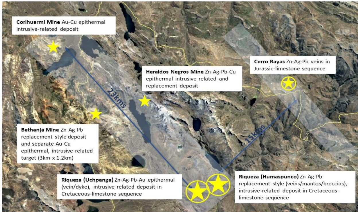
Figure 4: ABOVE A regional plan showing the location of Riqueza in relation to mines in the vicinity, the Corihuarmi Au-Cu Mine, the Bethanja Zn-Ag-Pb Mine, the Heraldos Negros Zn-Ag-Pb-Cu Mine. This important mineral belt, denoted by a broad pale blue line, runs parallel to regional mountain building processes such as compressional folding, thrusts and faults, and magmatic emplacements (stock intrusions). A parallel mineral belt hosts Cerro Rayas.

There are three mines within 25km of Riqueza that are intrusive-replacement deposits, Corihuarmi, Bethanja and Heraldos Negros (Figure 4). “This reinforces the possibility that Riqueza is also an intrusive-replacement deposit” says Mr Brown, who adds that “these mines, including Riqueza, are aligned in a NW-SE mineral belt, a further strong indication that the deposits have similar provenance.”