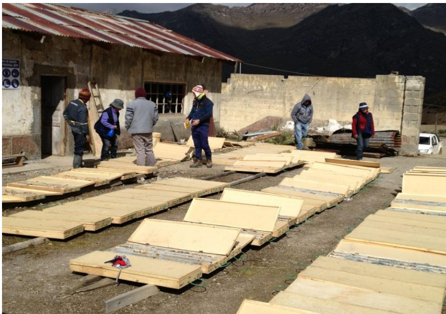
Core boxes laid out for systematic sampling